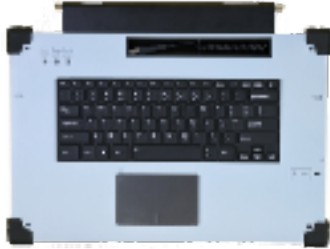
Keyboard with CAC Card Reader and dual USB ports

Rugged triple screen portable workstation