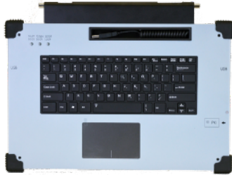
Keyboard with CAC Card Reader and dual USB ports

Rugged triple screen portable workstation